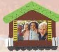
Wise Builder Photo Frame