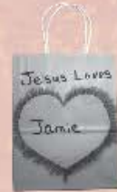
Jesus Loves Me Bag