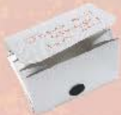
Galvanized Coin Pouch