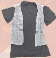
Construction Vest Craft