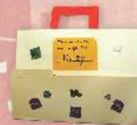
Prayer Tool Box