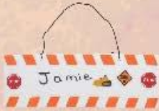
Barricade Door Hanger