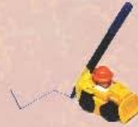
Truck Draw Craft