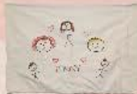
Pillow Case Craft