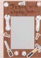
Jesus Loves... Mirror