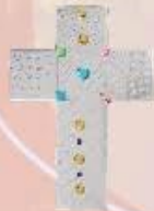
Etched in Steel Cross