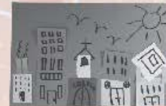
Sticky Note City