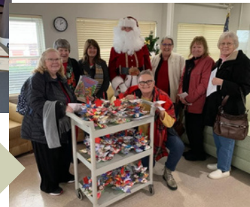
Gifts to Grayson Manor Residents