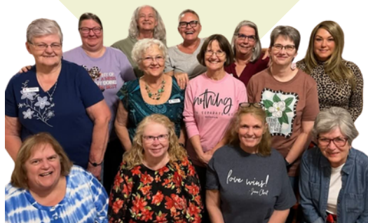
Our Volunteers (some not pictured)

In 2024, GCCWM volunteers led 227 sessions comprised of support groups, Bible study, individual peer counseling, and training sessions. Our registrations topped 160! We praise the Lord for His work in these lives!