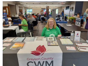
Thrive Resource Fair